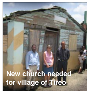
New church needed for village of Tiroo