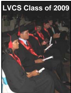
LVCS Class of 2009