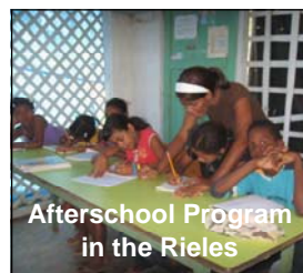
Afterschool Program in the Rieles

We didn't have the space to write about all our wonderful visitors this summer, or the special events we participated in, the best we could do were these snapshots. You can see them at our website!