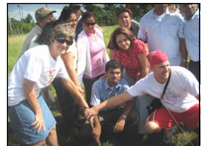
Together this project will be done!

This is an estimated $60,000.00 project. Please contact us if you are interested in helping!