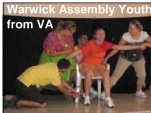
Warwick Assembly Youth from VA