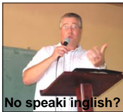
No speaki inglish?